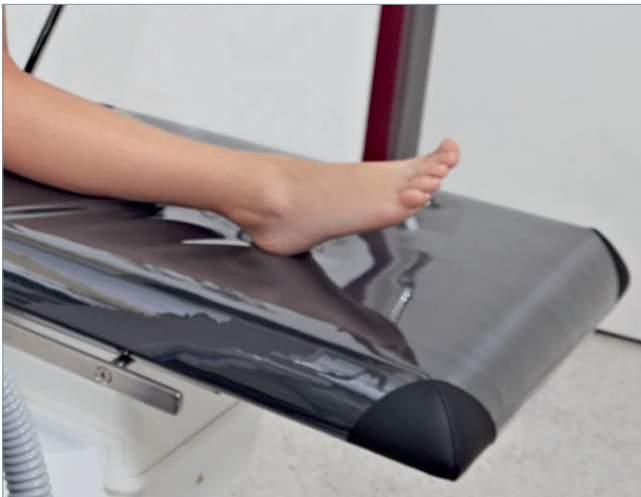
Radiolucent leg section for the lower limbs, shown with protective foil (optional)