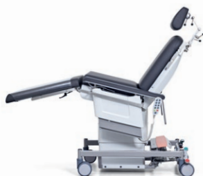
Zero gravity/relax position