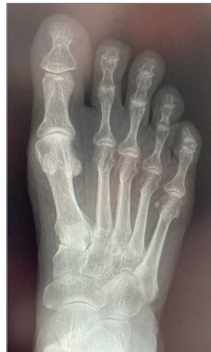
X-rays as examples of the foot and ankle