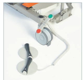
Foot switch for ergonomic free-hand surgery