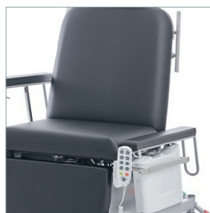
Armrests fully retractable