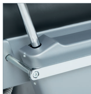
Standard bars for clinical accessories