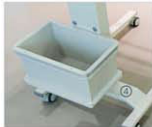
Box for patient's utensils