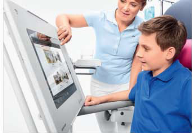
Even at the children's ward the SMT is favoured by patients.