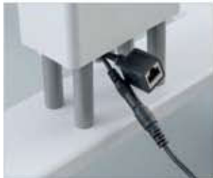
Cable outlet Plug & Play